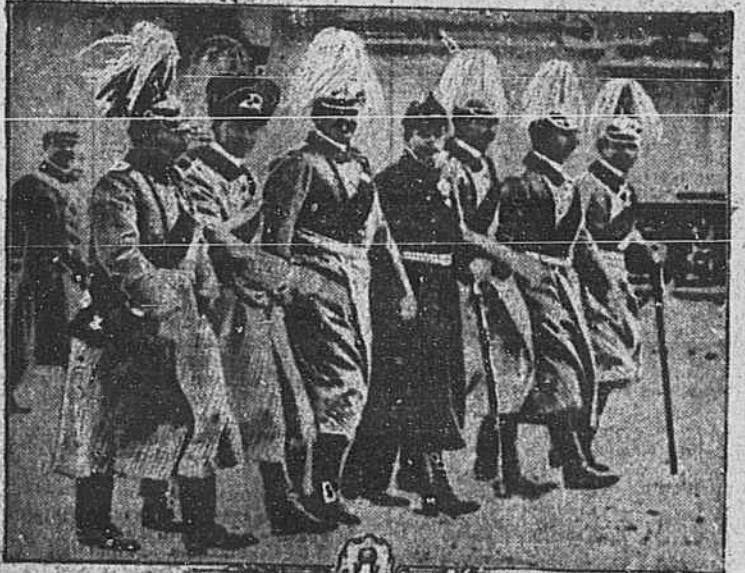
From left to right, Kaiser Wilhelm, Crown Prince Frederick William, Prince William Eitel, Prince Adolf, Prince August, Prince Oscar and Prince Joachim.