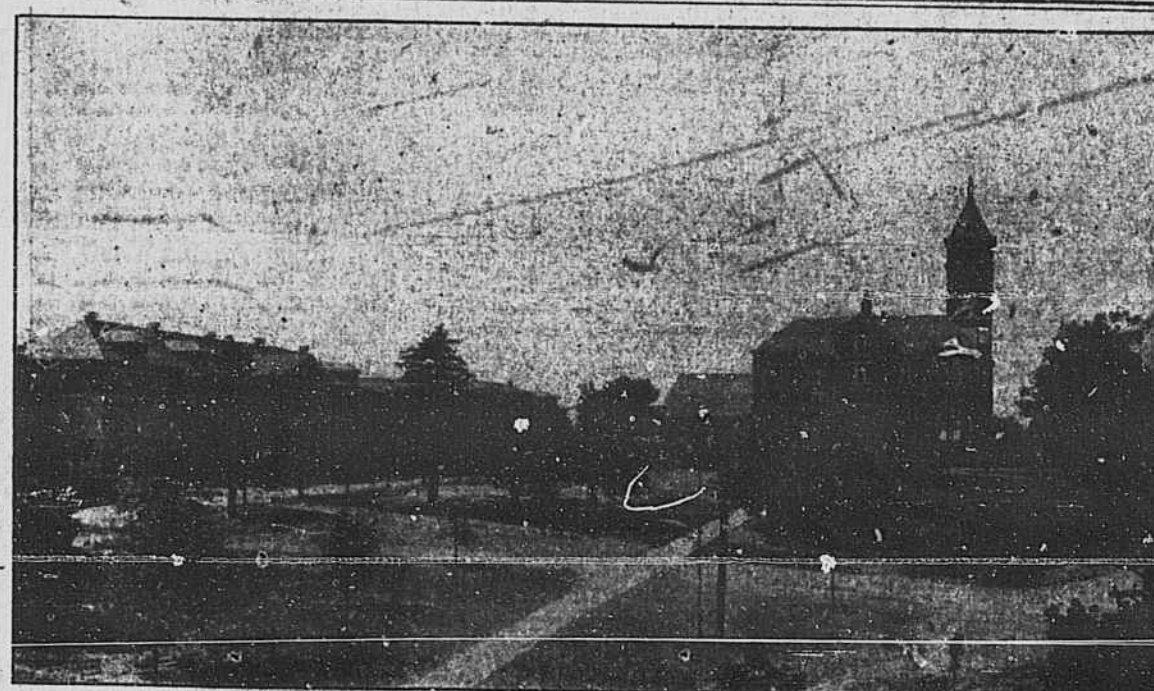
A VIEW OF CLEMSON COLLEGE, WHERE THE "OLD BOYS" ARE HAVING THEIR FIRST BIG RE-UNION TODAY AND TOMORROW.

news that her mother was ill and the information that she is better was welcomed in Anderson.