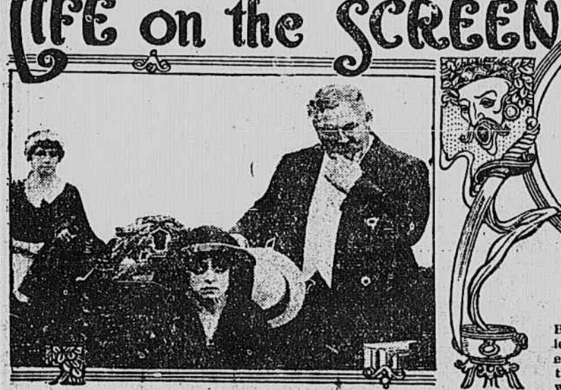
SCENE FROM "THE SEVENTH PRELUDE."