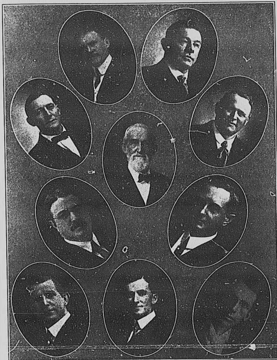
A GROUP OF THE BOARD OF TRUSTEES