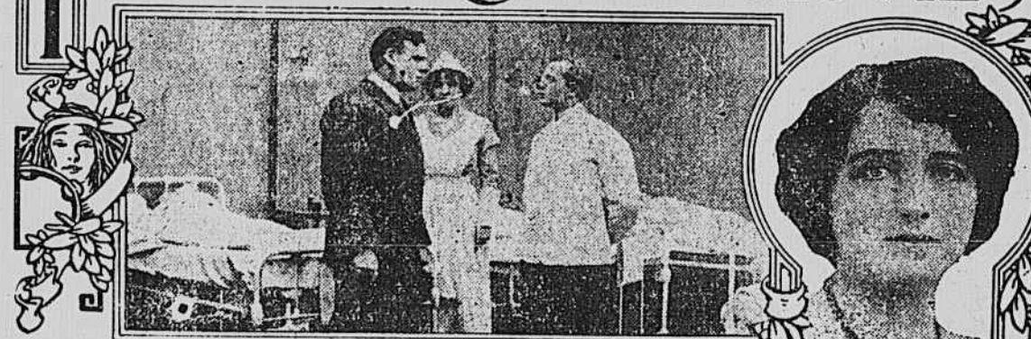
SCENE FROM "HIS SOB STORY."