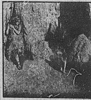
Scene From "Hearts Adrift" at the Bijou Monday.

Money For Virginia. Washington, June 13.—The senate today passed a bill appropriating $31,000 to cover the increased cost of procuring land for erecting fortifications at Cap Henry.