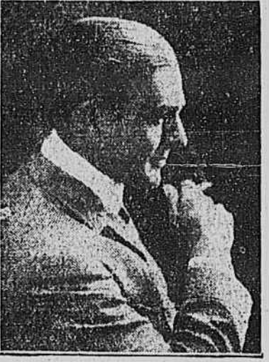
WALLACE REID (Nestor—Universal) Bijon today in "The Quack."