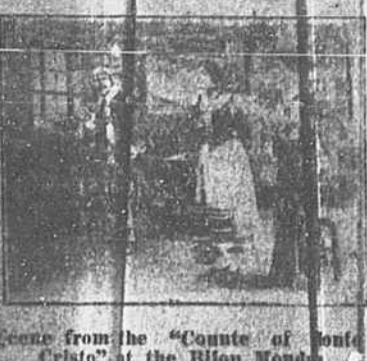
Scene from the "Count of Monte Cristo" at the Bijou Monday

FAMOUS PLAYERS TO BE SEEN HERE. The population of Anderson is expected to be greatly increased by the coming of the famous players of the Bijou Theatre, Monday, June 1. The players are: Mary Fuller, Dolly of the Dailies, and the famous players of the Bijou Theatre, Monday, June 1. The players are: Mary Fuller, Dolly of the Dailies, and the famous players of the Bijou Theatre, Monday, June 1.