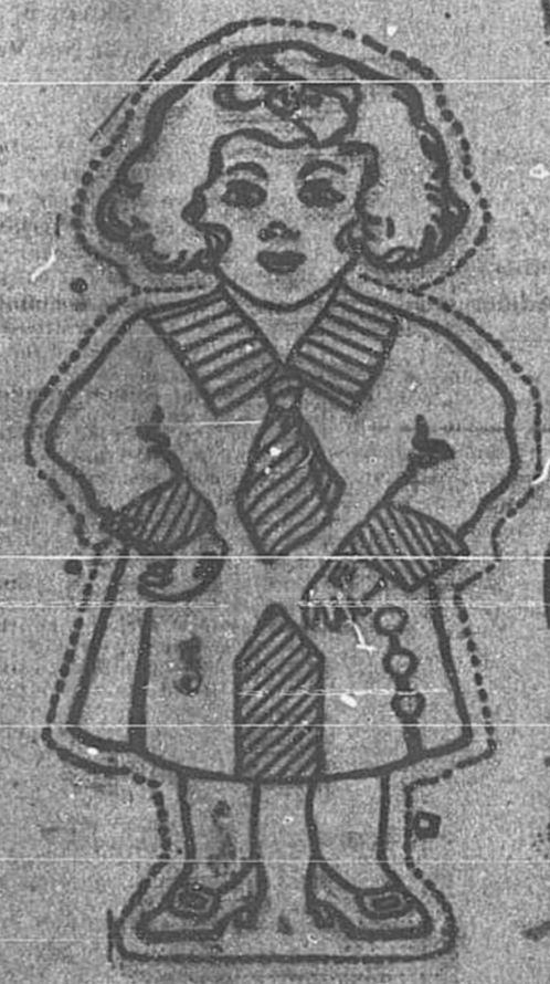
ACTUAL HEIGHT, 25 INCHES

These 3 dollies are beautifully printed on one large piece of muslin all ready to cut out and stuff. They have golden hair, big brown eyes and are very life-like indeed.