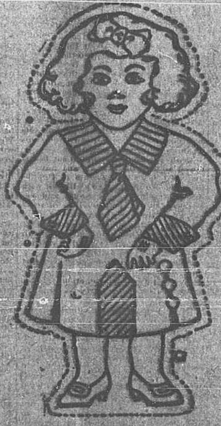
ACTUAL HEIGHT, 25 INCHES

These 3 dollies are beautifully printed on one large piece of muslin all ready to cut out and stuff. They have golden hair, big brown eyes and are very life-like indeed.