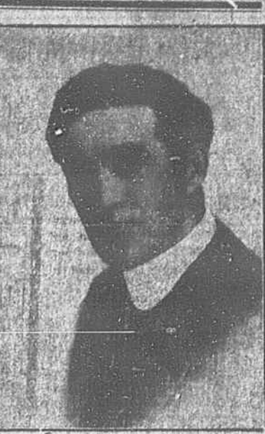
FRANCIS FORD Bijou Today in "Luelle, Love, the Girl of Mystery."