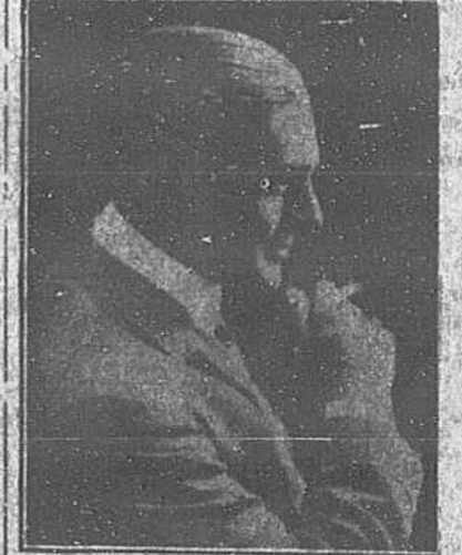
THAT'S THE WAY WALLACE REID (Nestor-Universal)

THE SPIDER AND HER WEB. Rex 2 reel drama with an all star cast, headed by Lois Weber and Phillips, we also find Wallace Reid and Dorothy Davenport in this superb feature.