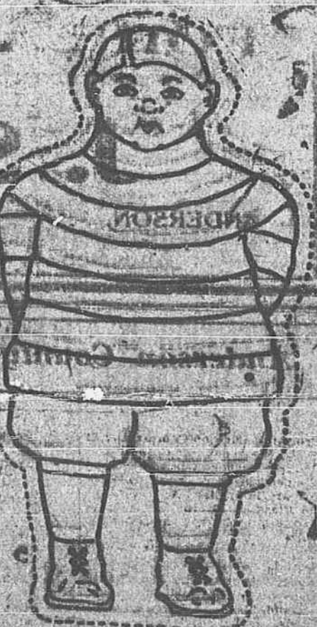
ACTUAL HEIGHT, 25 INCHES