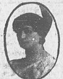
Lois Weber UNIVERSAL AS PORTIA

ferred to in the lines, but which does not take place upon the stage, has been shown in the screen production. Consequently the stage version has not been followed scene for scene, but many scenes which stage limitations have been injected into the piece. For this reason alone the film production will prove of great interest. Phillips Smalley has essayed the part of Shylock, and Lois Weber, Portia. If there has been any doubt as to Mr. Smalley's worthiness to take his place in the front rank of the greatest contemporary screen artists it will be shadowed on viewing the present play. Mr. Smalley is a thorough student of Shakespeare, having played leads in many of his plays before entering motion pictures. Mr. Smalley is also a keen student of human nature. This is plainly reflected in his characterization of Shylock, an interpretation that is original fresh and vigorous.