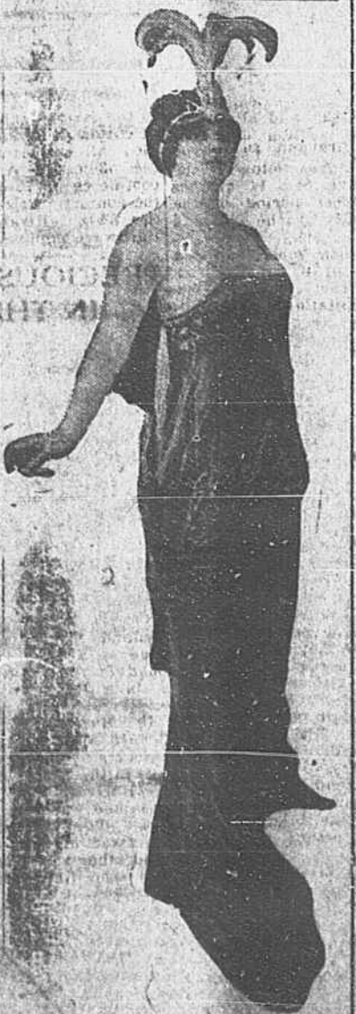
WITH TRAILING DRAPERIES.

The evangelist seemed to be in an angry mood this evening and during