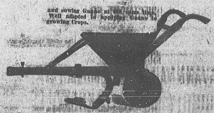
and sowing Guano at the same time. Well adapted to applying Guano to growing crops.