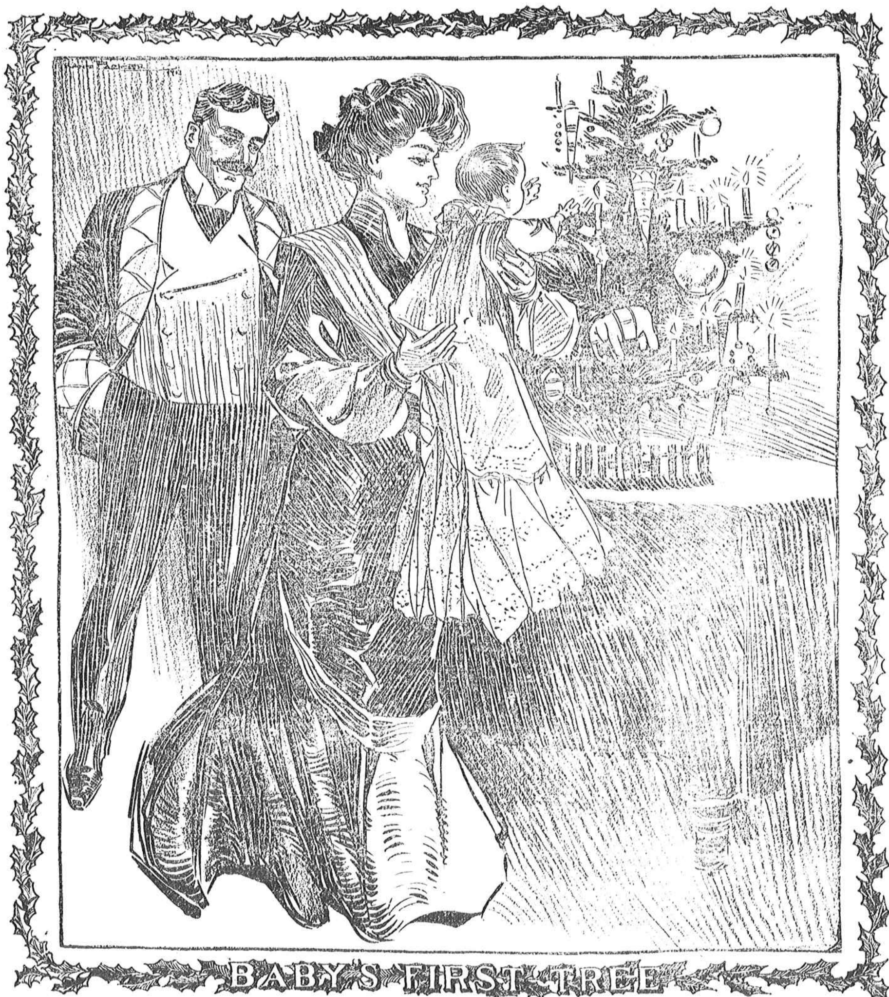
BABY'S FIRST TREE