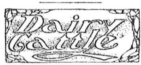
Dairy Cow Life.

When used as the basis of butter making the yaourt, usually prepared from sheep's milk, is introduced into either a goatskin or an earthen jar suspended by cords. Sufficient hot water is added to raise the temperature to 80 degrees. The opening is tightly closed and the jar is kept in agitation with a jerky movement for about forty minutes before the butter forms. The accompanying photographs portray this important feature in the domestic life of this region. The butter thus prepared is white and curly in appearance. The best quality retails at 2 1/2 cents per pound.