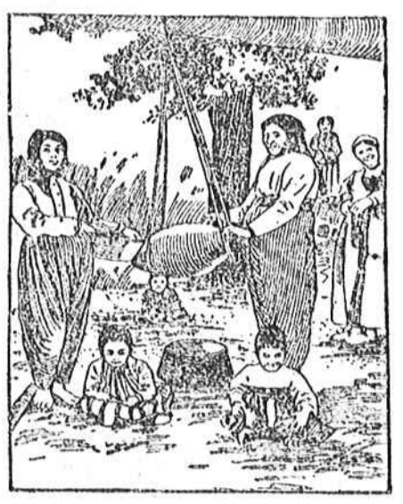
CHURNING IN HARPUT DISTRICT.

Fresh milk is heated in kettles to the boiling point and then allowed to cool to a temperature of about 80 degrees F.