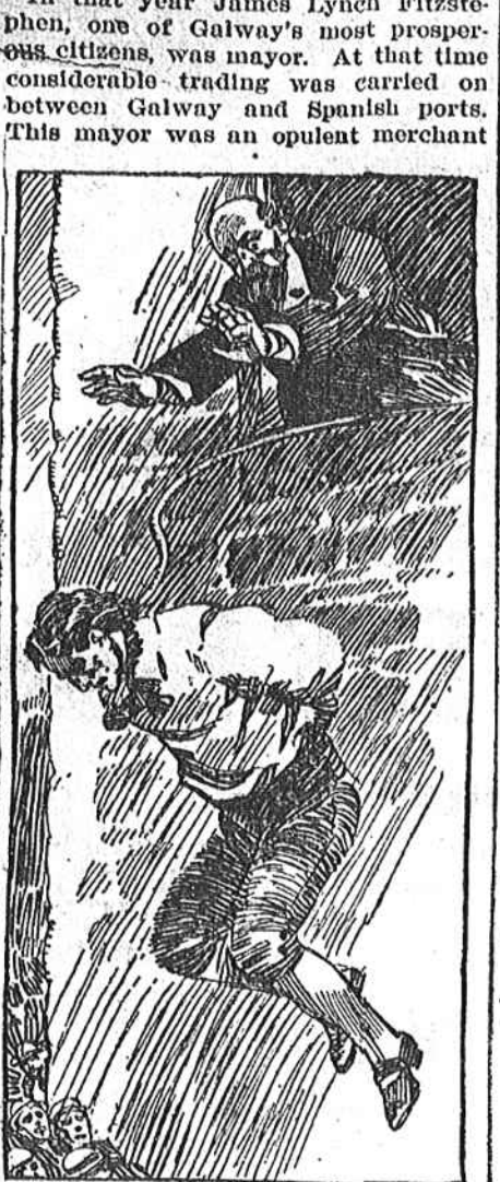
THE JUDGE LAUNCHED HIS SON INTO IRELAND.

Historic Tragedy How the Term Lynch Law Had Its Origin in the Long Ago. Pathetic Tale of a Stern Irish Judge Who, in the Discharge of Duty, Executed His Own Son. Nowhere in the history of human events is there a more pathetically fragile tale than that which gave rise to the expression "lynch law." Like many other fragile tales, lynch originated in Ireland. The event occurred in the ancient "City of the Tribes," now called Galway, and the date was 1493. In that year James Lynch Fitzstephen, one of Galway's most prosperous citizens, was mayor. At that time considerable trading was carried on between Galway and Spanish ports. This mayor was an opulent merchant