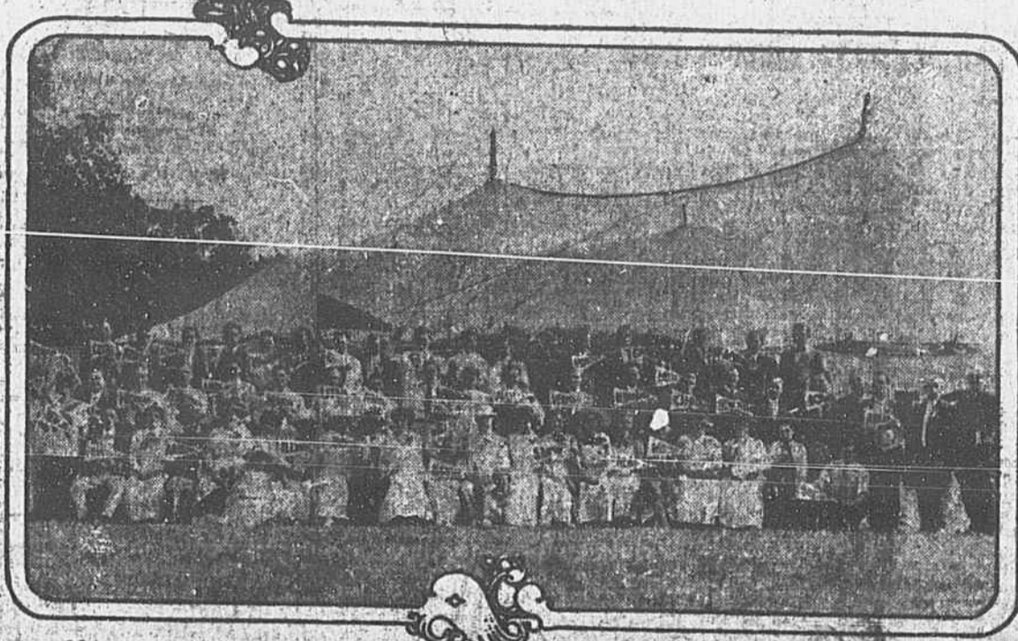
CHAUTAUQUA SCENE AT BATTLE CREEK, MICH.

WHEN the Redpath Chautauqua was at Battle Creek, Mich., last season on one day there were representatives present from forty different states and ten foreign countries.