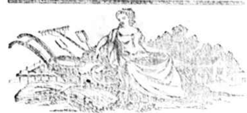
Agricultural. Staining Floors Again.

Advertisements inserted for less than one month will be charged for each insertion at the rate of 10 cents per line for each subsequent insertion.