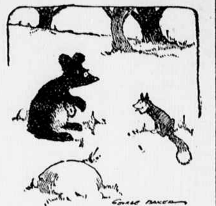
Fox (to bear)—Come over tomorrow and we'll play a game of golf on the links.

Bear—All right. I don't know what the game is, but if there's any job you can put up on the lynx I'm in with you.