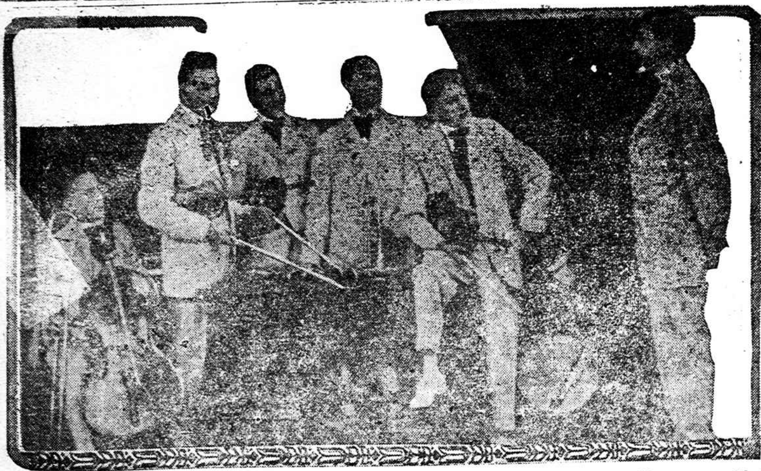
Cap's Orchestra. —One of the most widely known organizations of its kind, will open the Chautauqua with its programs of instrumental music. Almost every orchestral instrument will be used by this splendid group of young men.