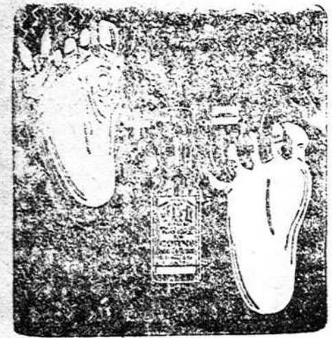
One Corn Plus "Gets-It" Equals One Foot, Corn Free.

They Peel off With "Gets-It." real corn-shrinker, corn loosen- by German naval forces. er, peel-it-right-off corn-remov- The losses were the result of an er. That's because two drops of attack on a convoy bound from Scot or before the above named date and