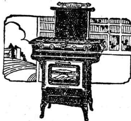
Detroit Vapor Oil Stove

HARDWARE, FARMING IMPLEMENTS, BUGGIES, WAGONS, PAINTS, OILS, Etc.