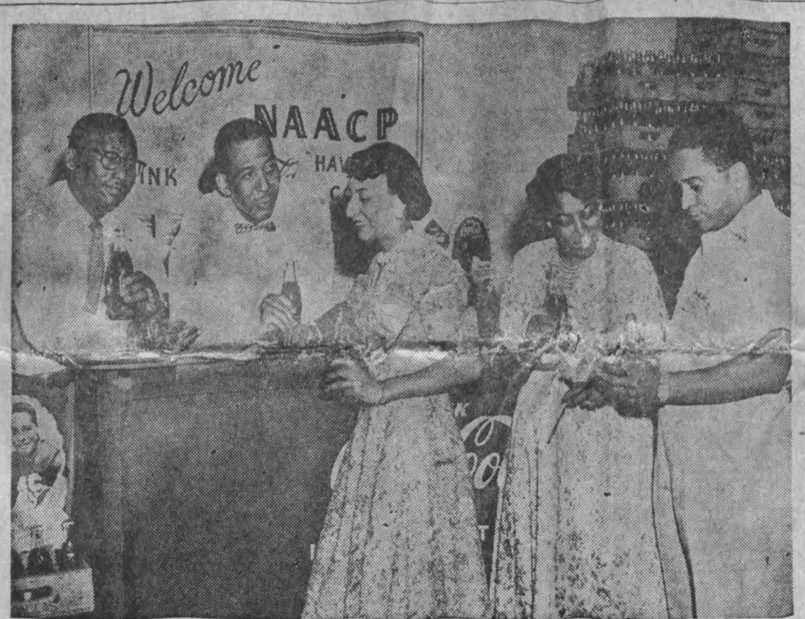
NAACP CONVENTION - GOERS enjoy free "Cokes" at their recent Texas meet.