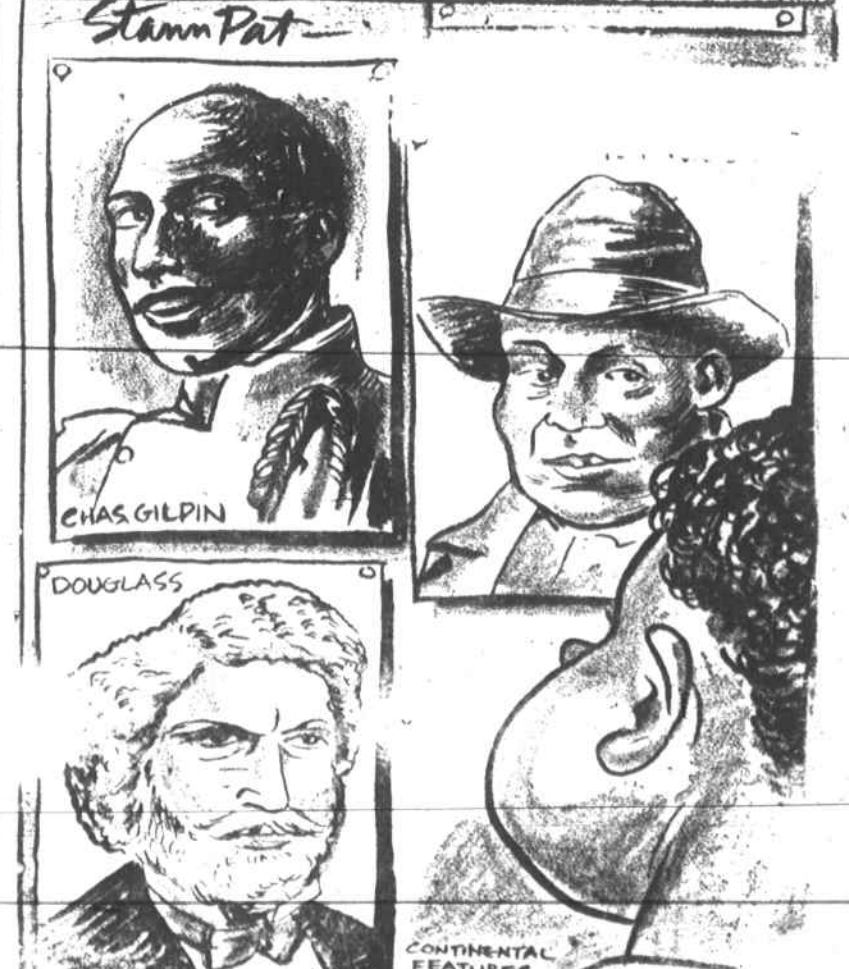
"Let NEGRO HISTORY Be A Part Of His Home Exams."