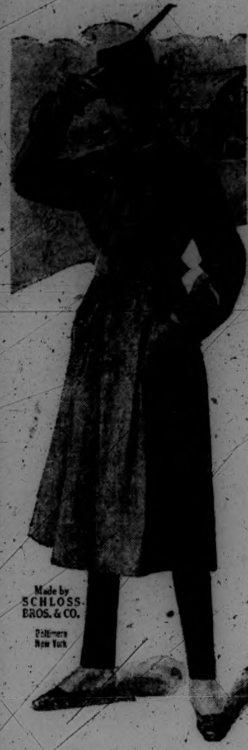
Made by SCHLOSS, EROS & CO. Baltimore, Md.