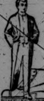
WALK-OVER SHOES FOR MEN

at the Walk-Over Store are firm "Walk-Over Men" afterwards, because there's a Walk-Over built for ever foot and the style, service and comfort is built in every part. Look at our window. It is full of reasons why you should wear Walk-Over Shoes. Come in and try on a pair and see how nice they feel on the feet.