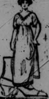
WALK-OVER SHOES FOR WOMEN

Shown in all fashionable leathers and colors. The Walk-Over line has a well-earned reputation for originality of style. Quality of Workmanship and a price moderation not found in most high-grade shoes. Our window affords an interesting study in the new styles in shoes decreed by fashion. Let your next pair be Walk-Overs.