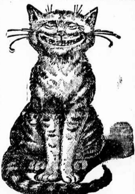
Our cat says it is a mean man who never has a generous impulse.

"Five million volunteers," says General Sir Ian Hamilton, "that is what no historian will be able to understand."