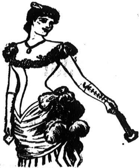
"The Mother's Perfect Glove Fitting." Advise all to buy a pair and be convinced.

Fine Kid Gloves in black and colors. Lace with narrow embroidery being the very latest and best styles just introduced, $1.00, $1.25, $1.50 and $2.00.