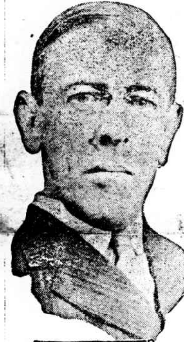
WILSON, N. J.