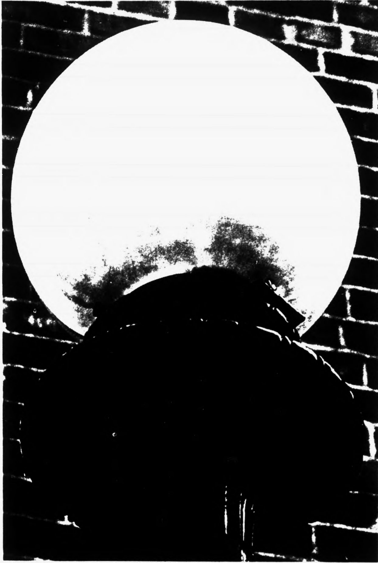
WHERE IS THIS? —The globe shown above is located in downtown Clinton. Do you know where it is? This is one of a series of photographs taken by Clinton artist-photographer Betty Fryga in the downtown area. The answer is printed upside down below.

Three Sections, 18 Pages Classified ..... 4-A Deaths ..... 3-A Editorials ..... 2-B Society ..... 2-A, 3-A Sports ..... 5-A