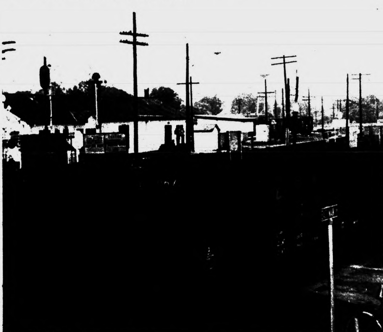
NERVE GAS - Train cars loaded with nerve gas are shown moving