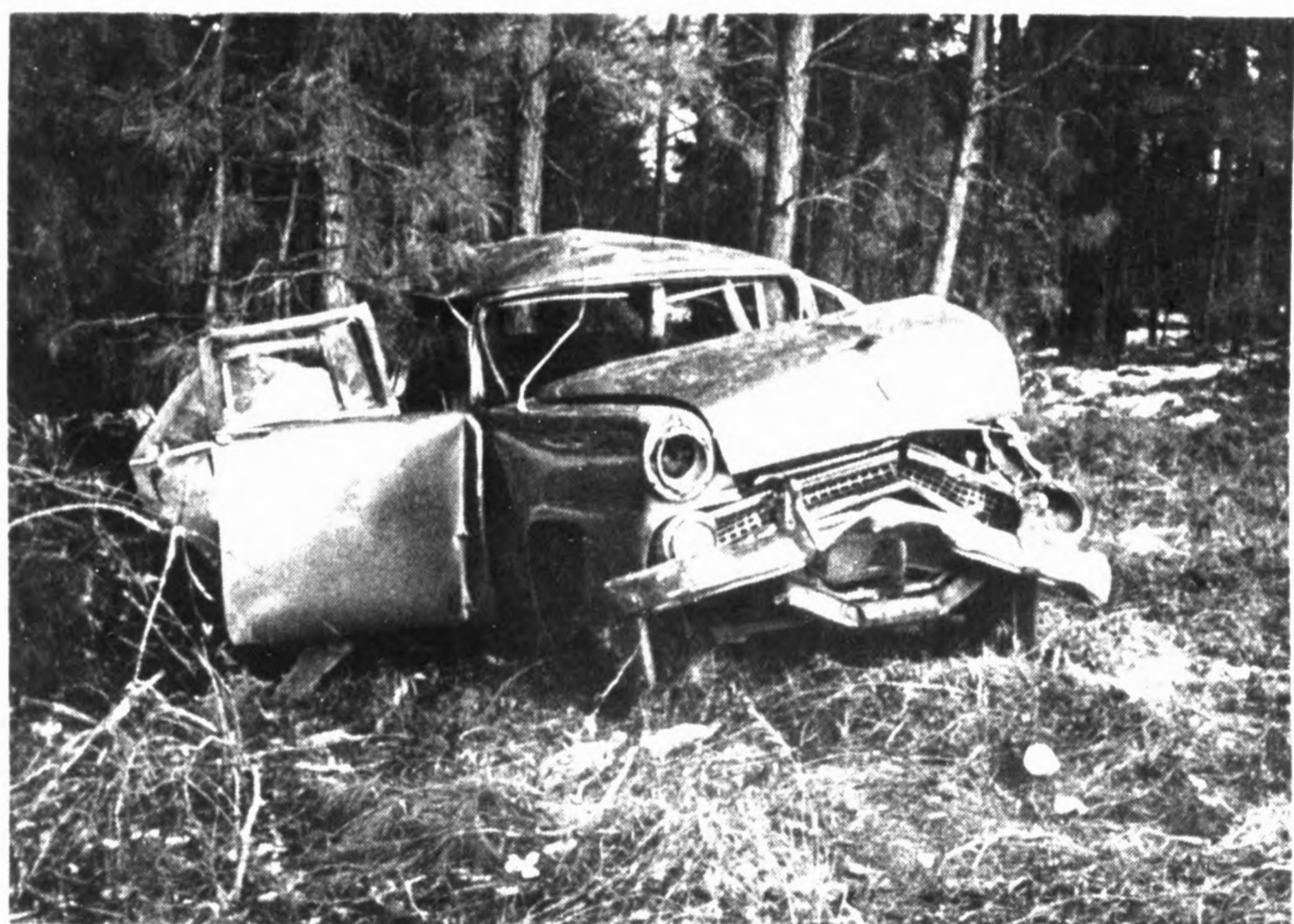
CAR IN WHICH YOUNG MAN WAS KILLED FRIDAY