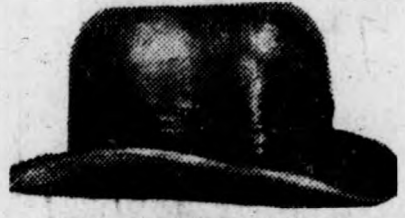
THE BRONZE DERBY

Thanksgiving Day is one of the company's designated holidays with pay for all eligible employees, officials stated. Operations will resume with the regular third shift at 12 midnight Thursday.