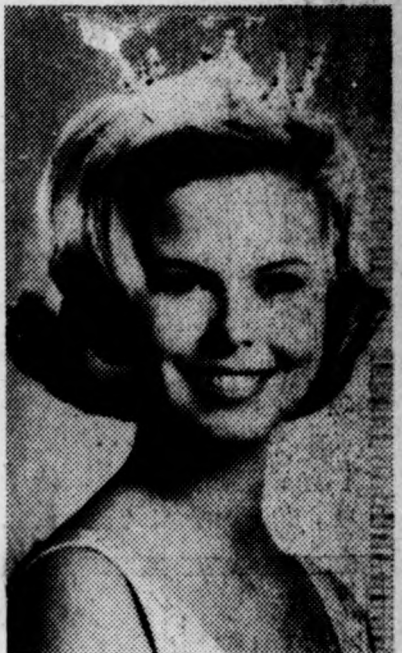
MISS SOUTH CAROLINA