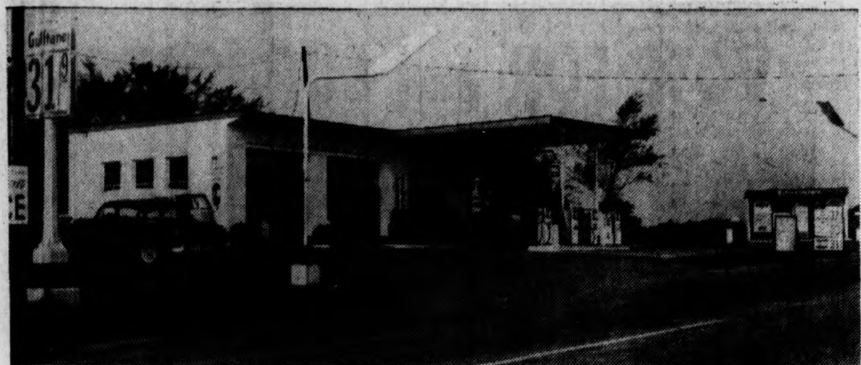
Where Theft Occurred

No charges were filed against bus driver Billy Reeves of Augusta, Ga.