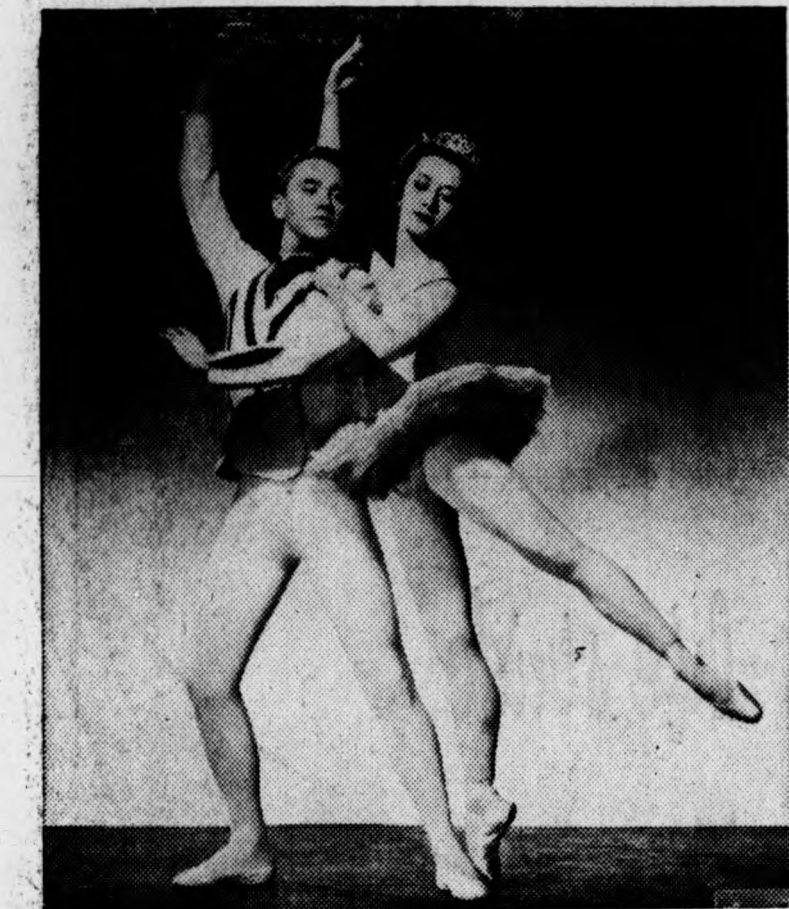
Last of Concert Series