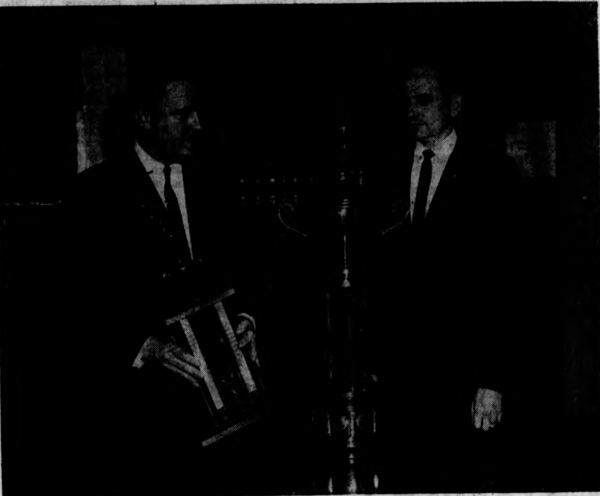
Clinton Leaders Get Trophies