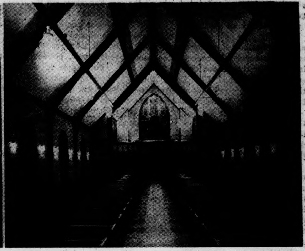
From Pulpit Toward Balcony