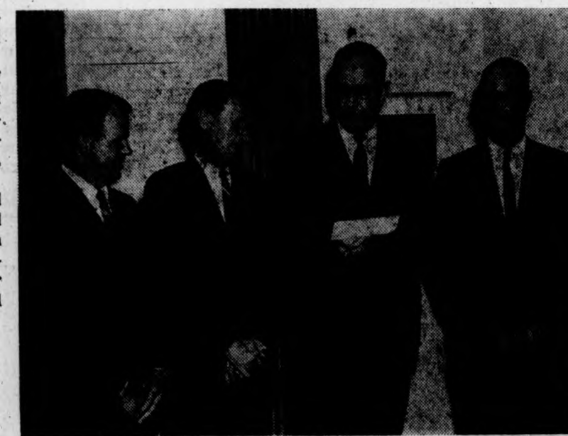
Texaco Makes Gift To College