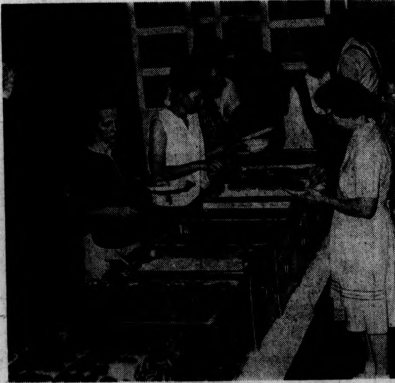
Lydia Plant Employees Enjoy Dinner