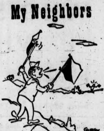
"Hey—watch your language!"