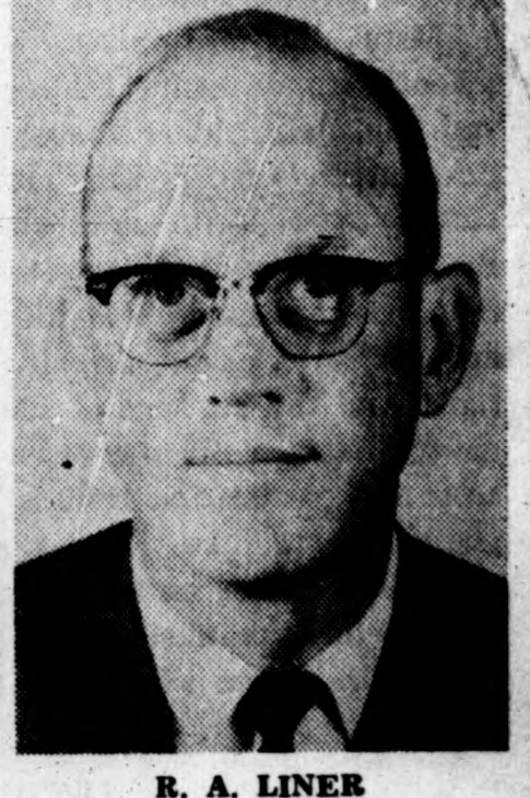
Vice Pres. Manufacturing