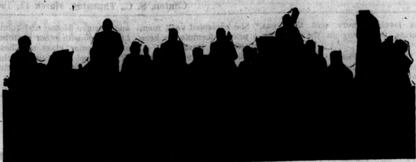
CHICAGO LITTLE SYMPHONY