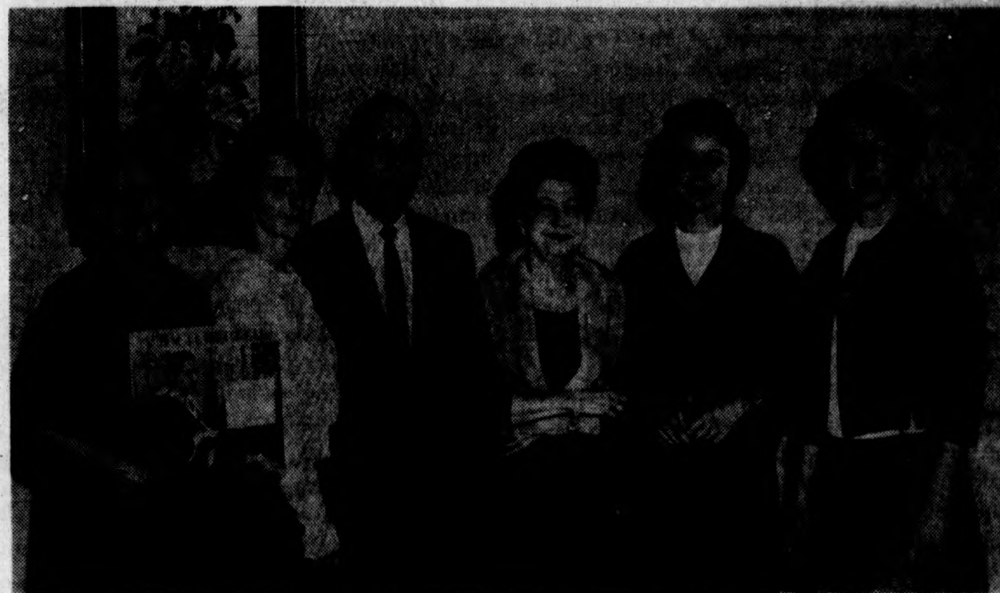
Clinton Concert Association Leaders

In a short session Friday night, City Council approved the installation of a traffic light at the intersection of Florida and N. Woodrow Streets.