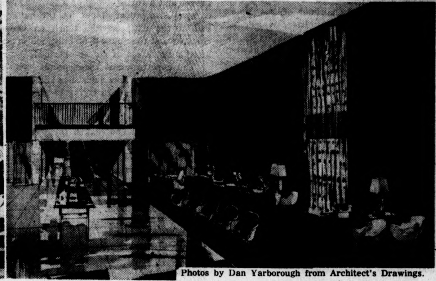
from Architect's Drawings.