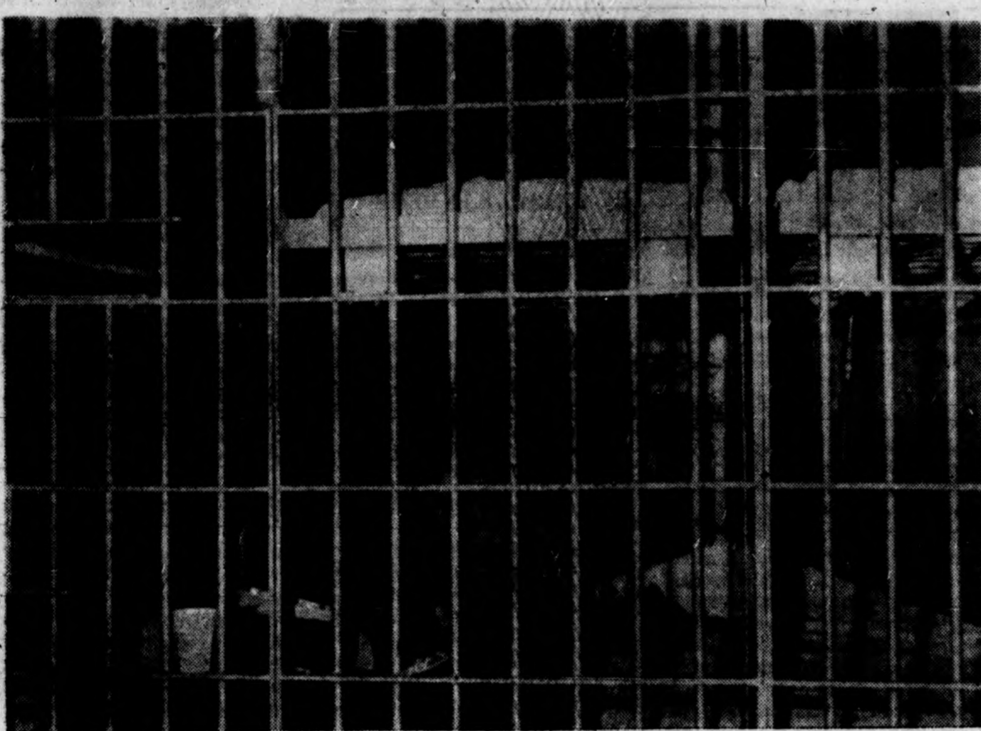
Prisoner Held in Clinton Jail