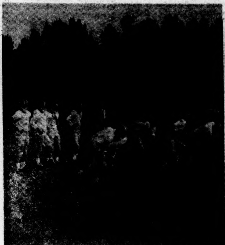
The 1964 football season is almost here—as these photos show. The Clinton High Red Devils have been

Clinton, S. C., Thursday, August 27, 1964