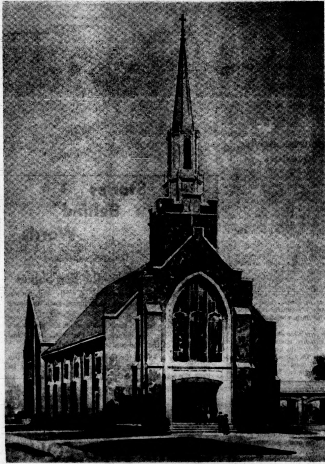
Proposed New Sanctuary of First Baptist Church