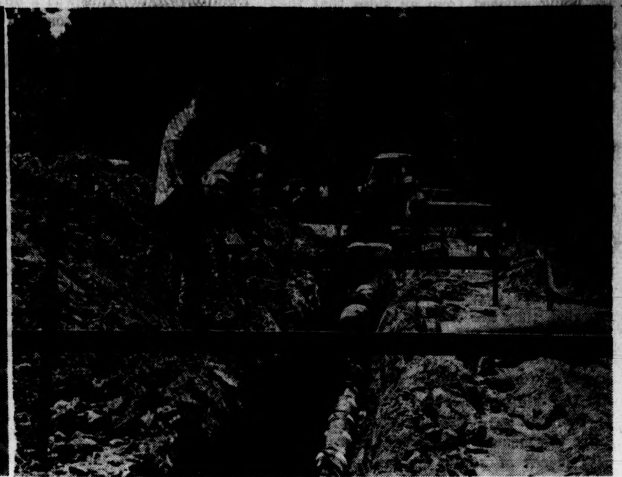
the S. Bell St. section, while the scene at right shows building of a new outfall line in the Gideon Hill area.