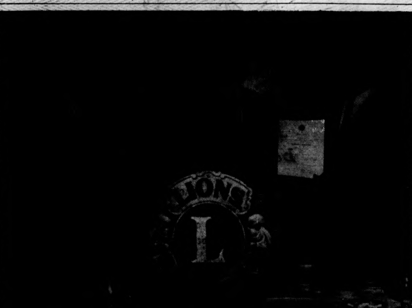
Presented Lions Club Award

Telephone and postage Coroner: $336, minimum $125. Rental of public address County Commissioners: $110, system Contingent fund