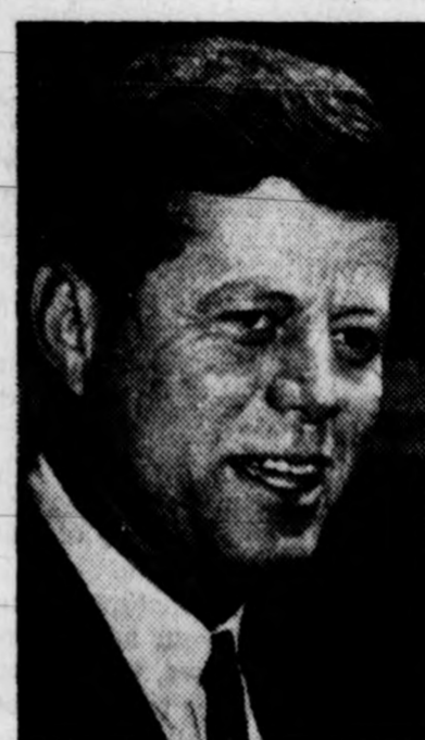
JOHN F. KENNEDY

The Clinton Community Chorus will meet tomorrow (Friday) evening at 7:30 instead of 8:00 as previously, in the First Presbyterian Church Fellowship room.