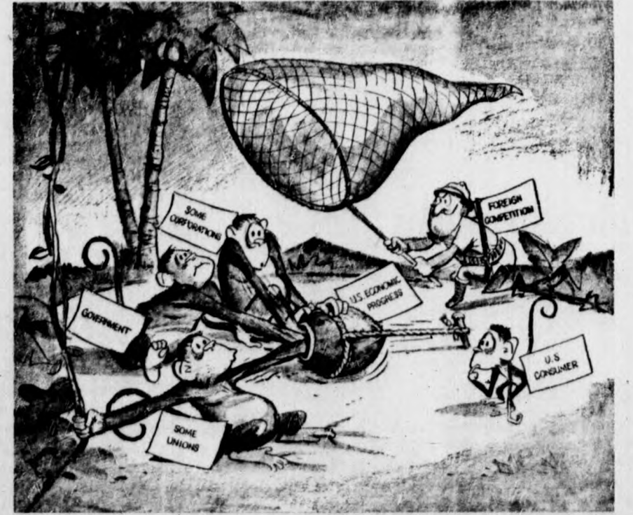
Monkeys are caught by filling a coconut shell with chopped coconut meat. The monkeys grasp a fistful and, unwilling to let any go, cannot withdraw their paws. So, they are easy victims. The U.S. consumer is not yet as scrawny as shown, but unless there is a more equitable division of the productivity increases, he will get that way. One of the three American groups must get go, and set an example—or all will be captured and, along with the consumer, all will suffer.

P.S. Some may say one company can't do much about national problems as big and complex as those cited above. Well, that's what skeptics said about Rambler's first crusade. Let's remember, every great thing is born small. If this new Rambler crusade is right, it can succeed and spread, just as the compact car concept did.