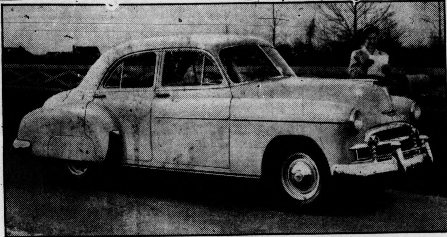
The Styleline, one of two individually designed sedans which have achieved immense popularity with Chevrolet owners, will have new beauty in 1950. Improved grille work, sturdier bumper guards and more tasteful ornamentation are some of the exterior improvements. New Chevrolet also offer increased power and comfort with the Powerglide automatic transmission as optional equipment on De Luxe models.

The new Chevrolet will be shown here for the first time on Saturday, January 7, in the show-rooms of Giles Chevrolet Company, local distributors.